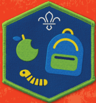
All About Adventure