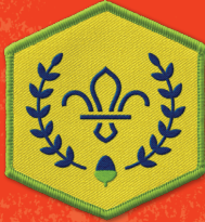
Chief Scout's Acorn Award