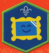
All About Me