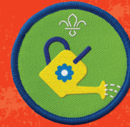
Let it Grow