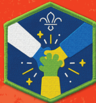
All Around Us